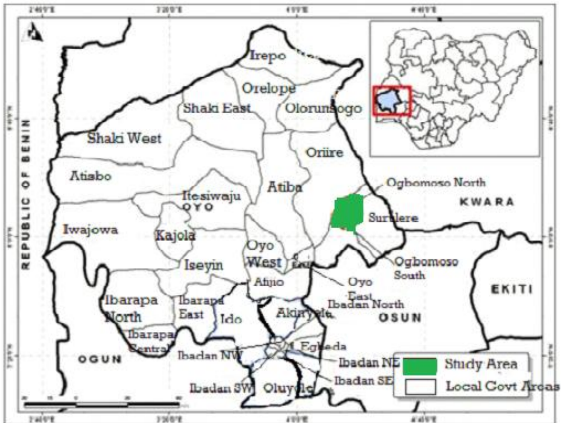
Fig. 1. Map of oyo state showing the study area (Inset: Map of Nigeria showing the location of Oyo State)

is one of the many Yoruba settlements situated to the south-west of Nigeria, where urbanism as a way of life predates the European colonization of the country. Like the origin and development of most Yoruba settlements in the early 18th century, the city emerged from the activities of five different waves of migrants, who settled in different areas of the present city. It was the last wave of migrants, led by Soun Ogunlola, who as a result of their warring prowess, subjugated and pacified the separately developing villages and hamlets in the surrounding areas to form a large settlement known today as Ogbomosho. The initial impetus behind the growth of the city was provided by a substantial influx of refugees from the internecine wars in Yoruba land in the early 19th century, and of refugees fleeing the Fulani Jihadists who overran most of the northern towns, including Ilorin, situated approximately 80 km from Ogbomosho.