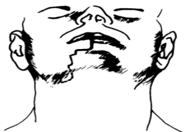
Fig. 1. Stepped incision