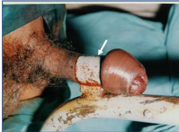
Fig. 4. Photograph showing after reduction of penile size