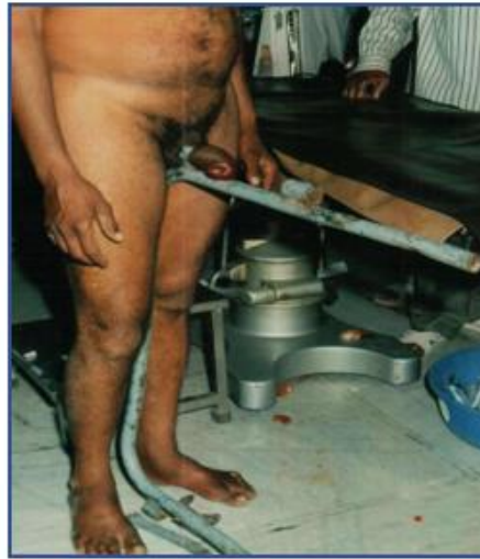
Fig. 1. Photograph showing Penile strangulation in the metal pipe

At the 4-week follow-up, the wound had healed well, and the patient reported no urinary symptoms, erectile dysfunction, or priapism (Figs 1-6).