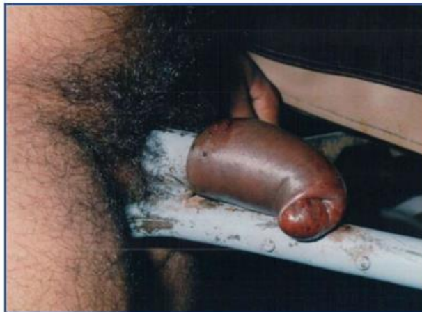
Fig. 2. Photograph showing strangulated distal edematous penis and prepuce