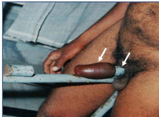
Fig. 3. Photograph showing strangulated engorged penis distal to metal pipe