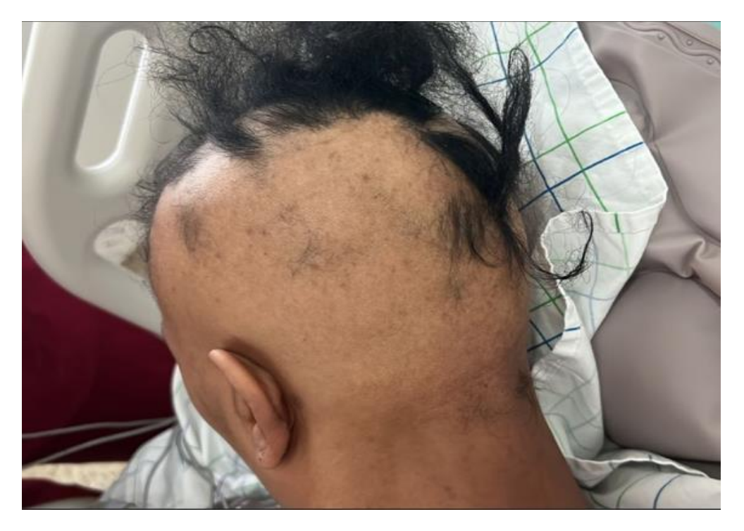
Fig. 1. Image of the alopecia from which the patient suffered

contact on the right. The rest of the examination hasn't found any other abnormalities.