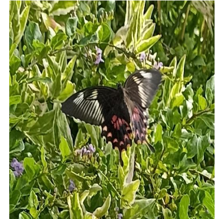
Indian common rose (Pachliopta aristolochiae )