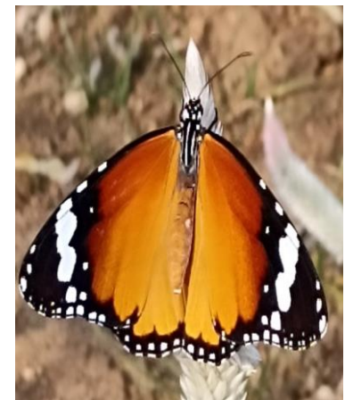
Plain tiger (Danaus chrysippus)