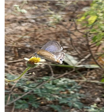
Grass jewel ( Freyeria trochilus )