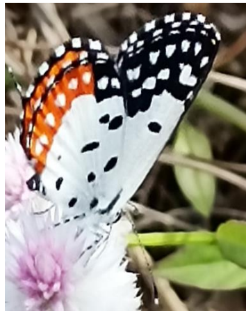
Red pierrot (Talicada nyseus)