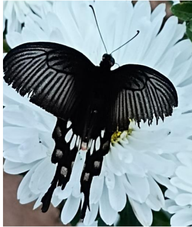
Black swallow tail (Papilio polyxenes)