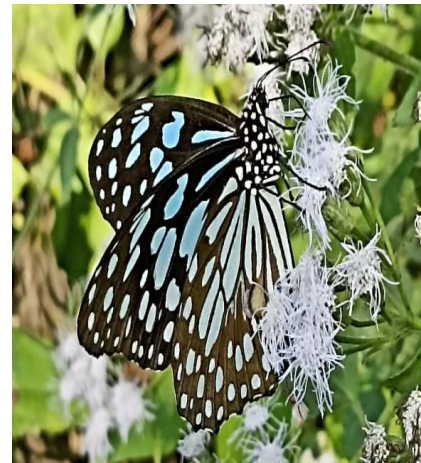
Blue tiger (Tirumala limniace)