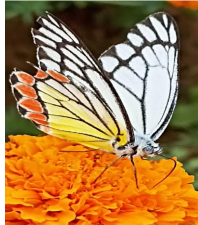
Common jezebel ( Delias eucharis )