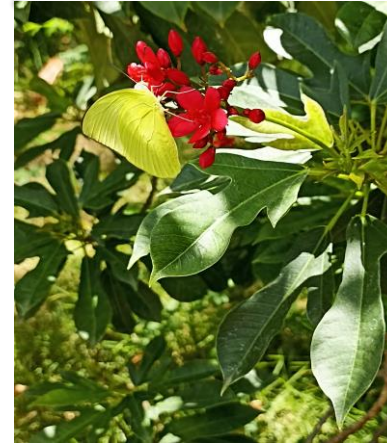
Common emigrant ( Catopsilia pomona )