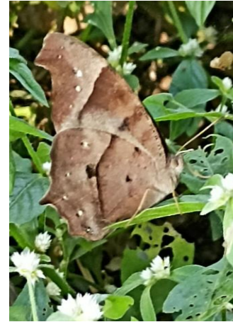
Common evening brown (Melanitis leda )