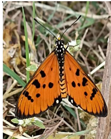
Tawny coster (Acraea violae)