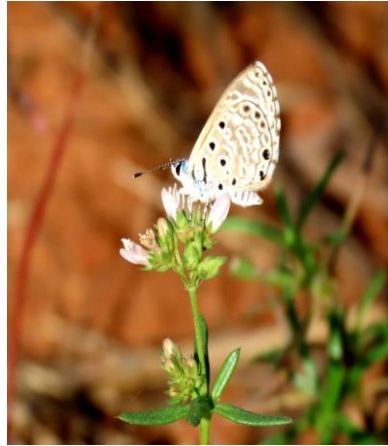
Grass blue ( Zizeeria karsandra )