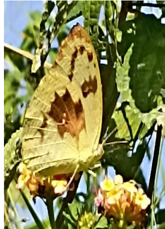
Mottled emigrant (Catopsilia pyranthe)