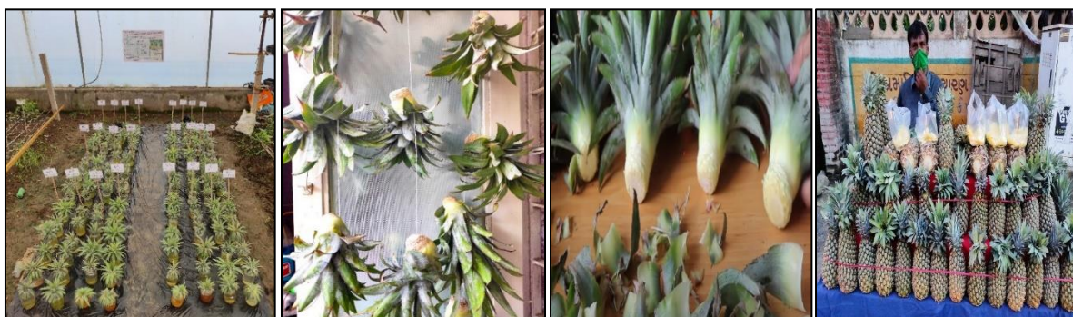
Fig. 1. A. Collection of crowns, B. Removing leaves & excess parts, C. Sun Drying of pineapple crown for 24 hrs. D. General layout of experiment

Various parameters were assessed in this experiment, including number of days required for rooting, percentage of rooted crown, length of root, number of roots, fresh and dry weight of root, number of leaves, length of leaves, fresh and dry weight of shoot. All the data collected on these growth parameters were subjected to statistical analysis using the methods recommended by Panse and Sukhatme [6].