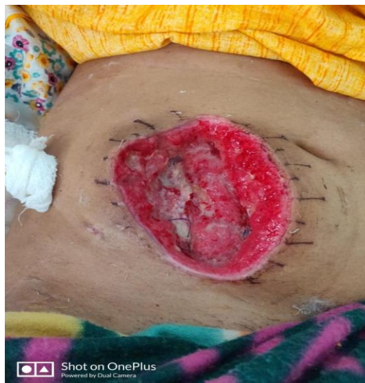
Fig. 4. Post-operative wound infection