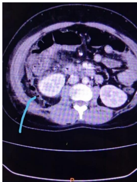
Fig. 1. Blue Arrow shows air in the retroperitoneum

Post-operatively, the patient suffered from surgical site infection and dyselektrolytemia. Gradually, the condition of the patient improved and orally allowed from 4 th post-operative day. Abdominal drain output gradually decreased and removed on 6 th post-operative day. The patient had wound dehiscence and regular wound dressing done with EUSOL. Secondary wound suturing done on postop day 19 and discharged on postop day 24. The patient was reviewed for stitch removal after 10 days. On subsequent followup, the patient was doing fine.