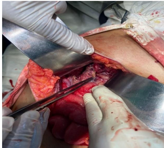
Fig. 3. Posterior peritoneum inflamed and necrotic