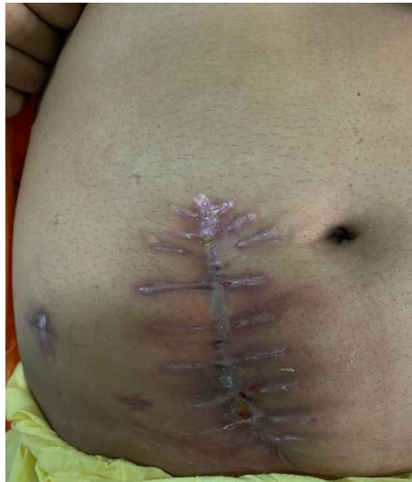
Fig. 5. Healing after secondary suturing