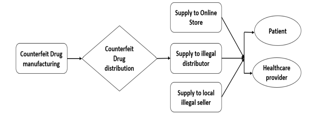
Fig. 1. Illegal supply chain of counterfeit drugs