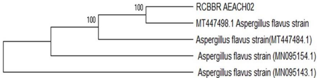
Fig. 2. Phylogenetic tree of A. flavus

NAME: Aspergillus flavus . Strain: RCBBR_CH3. Accession NO: ON584559