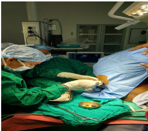
Fig. 4. Operative period

The procedure was uneventful. Once procedure was done patient was shifted to post anesthesia Care Unit. Vitals were monitored and patient was stable. In the postoperative period, the effect of spinal anesthesia lasted for 2 hours. For pain management, the patient was given tramadol and paracetamol according to the intensity of pain.