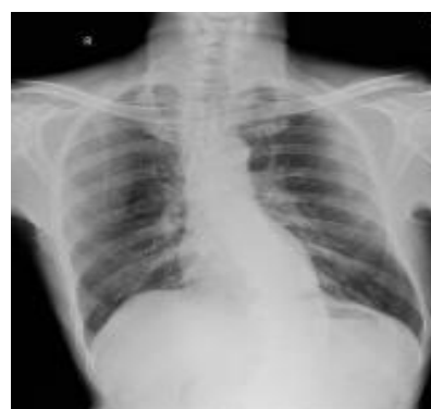
Fig. 2. X-ray image