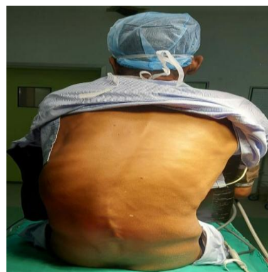
Fig. 1. On examination of spine a lateral curvature present with kyphoscoliosis

Lumbar vertebrae and intervertebral spaces of the patient were scanned with an 8MHz headpiece of the ultrasound. Transverse processes of lumbar vertebrae, and dura were tried to be detected using a convex vertical probe. For spinal access, L2- L3 intervertebral space through which dura can be observed was selected. Under the guidance of Ultrasound, subarachnoidal space was entered at the first attempt using a 23 G quinckes spinal needle directed 45°-60- degrees cephalad. After observing outflow of cerebrospinal fluid, 3.4 ml of bupivacaine heavy (5 mg/ml) was injected through the spinal needle slowly.