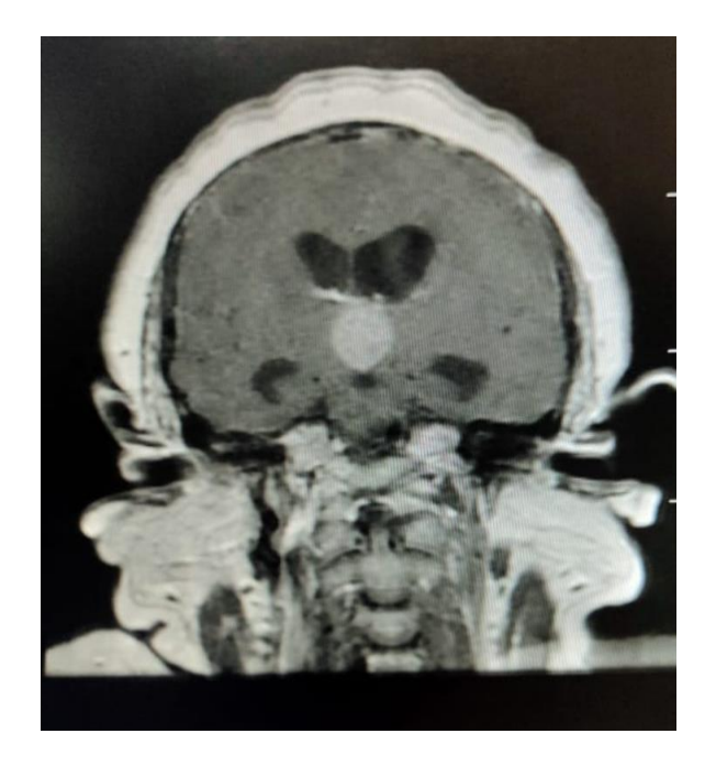
Fig. 2. MRI BRAIN T1 WI CORONAL IMAGE