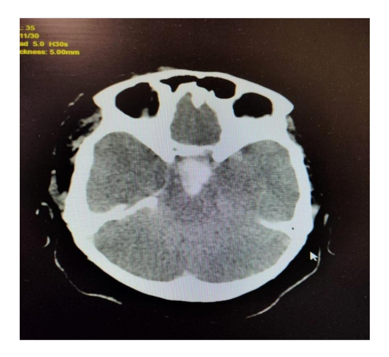
Fig. 4. CT scan brain plain (POST-OPERATIVE)

collection was noted in occipital horns of bilateral lateral ventricle and 4th ventricle. Minimal blood density collection in bilateral Sylvian. Fissure, basal cisterns, falx, and tentorium cerebelli s/o minimal subarachnoid hemorrhage and subdural hemorrhage. Bilateral diffused cerebral edema with effacement of sulcogyral spaces. The bilateral gangliocapsular region appears normal. Cerebellum, brainstem, cisternal spaces, and posterior fossa structures appear normal. Visualized orbit appears normal. Mucosal thickening noted right maxillary sinus and left sphenoid sinus s/o sinusitis. The patient's prognosis was good with enhancing recovery.