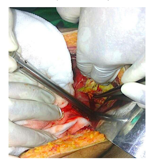
Fig. 3. Intraoperative photograph showing the site of rectal perforation

Surgery is not always required. In intramural or small retroperitoneal perforations, good results are reported with conservative treatment consisting of bowel rest, combined with total parenteral nutrition, intravenous fluid treatment, and broad-spectrum antibiotics [5,6]. Surgical debridement is only required in case of large amounts of leakage and intramural abscesses, or in patients not responding to conservative treatment [7,8].