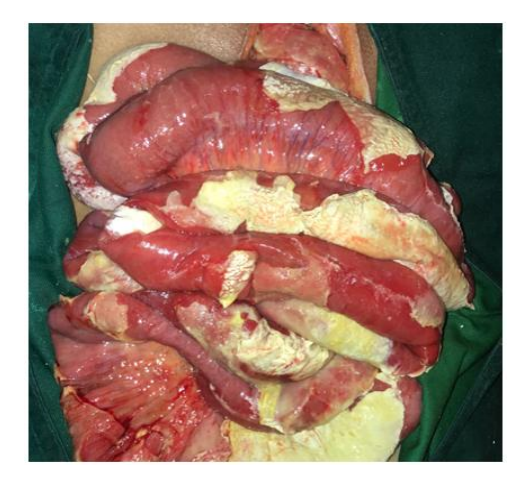
Fig. 2. Barium leakage arround the intestine and peritoeal cavity

presence of rectal mucosal disease such as cancer, stricture, diverticulosis or inflammatory bowel disease [1]. Rarely the colon may burst due to excessive transmural pressure alone [2]. Different types of perforation have been described in the literature. One study classifies the perforation as either intramural (incomplete) or extramural (complete) [3]. Peterson et al. divided perforations into five categories: 1) perforations of the anal canal below the levator ani muscle, 2) incomplete perforations such as perforation of the rectal mucosa, 3) perforations into the retroperitoneum, 4) transmural perforations into the adjacent viscera and 5) perforations into the free intraperitoneal cavity. The clinical signs, radiological findings, treatment strategies and prognosis may vary in each category [4].