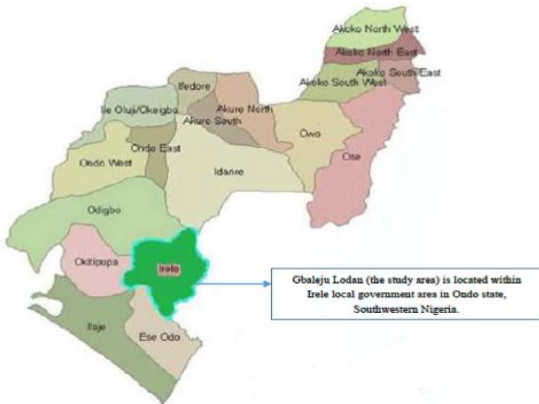
Fig 1. Geological map of Southern part of Ondo state showing the study area

The plant samples were charred and then finally ground into fine powder, the ash samples were cooled at room temperature. The cooled ash samples were weighed. For radionuclide contents analysis, samples were kept in radon tight containers for a minimum of 4 weeks so as to reach secular equilibrium between radon and its daughter nuclei [10].