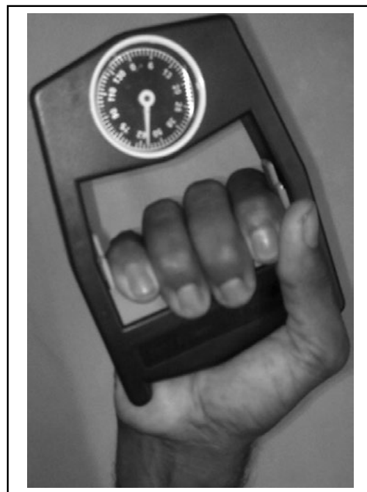
Fig.5: Measuring Grip Strength with Dynamometer.

Beharrie et al. in 2004 19 published a study comparing these two methods. They showed a clear advantage of Kirschner's Wires fixation over T-plate method. Avoided for want of brevity Radwanetal. 6 Hull et al. 20 have not found the wire fixation to be superior to the plate fixation technique. Our observations favor study K Wire to be more effective giving excellent results in terms of functional outcome as compared to that of T-plate. The main difference was Hull and Peter used volar locking plates while we used simple T-plate. But as in any operative procedure the skills of the surgeon is a major confounding variable between our two