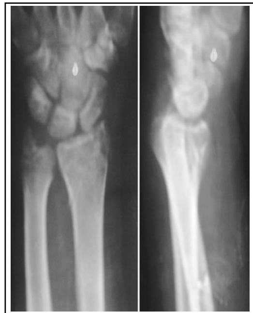
Fig.3: Radiographs after removal of K-Wires showing Fracture Union.

Most of the patients fell in Fernandez classification II/III (Table-I). Grip strength was measured by grip strength dynamometer. In Group-A 12(86.67%) patients had excellent and 3(13.33%) patients had good outcome. While in Group-B 8(53.33%) patients had excellent and 7(46.67%) patients had good outcome (Table-II). The functional outcome criteria was based on Modified clinical scoring system of Green and O'Brien. According to p-value final outcome was significantly associated with treatment groups. Among Group-A patient's final outcome was excellent in 86.67% patients while in Group-B only 53.33% patients had excellent outcome Fig. 1-5. Our results clearly favor use of Krischner's Wires for intra articular distal radius fractures. No notable complications were noted in any of the cases except some minor wound problems.