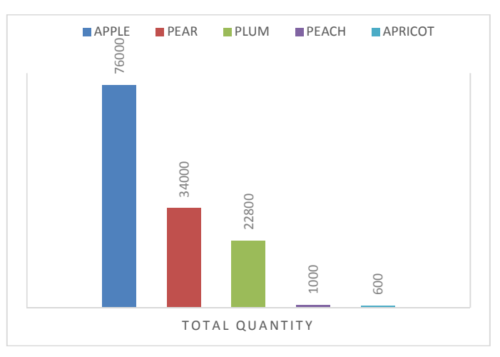
Graph 1. Quantity of species