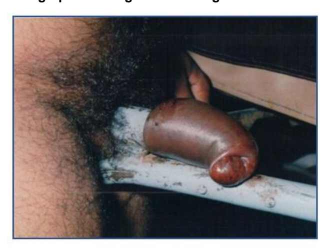
Fig. 2. Photograph showing strangulated distal edematous penis and prepuce