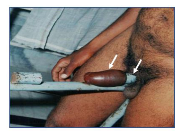
Fig. 3. Photograph showing strangulated engorged penis distal to metal pipe