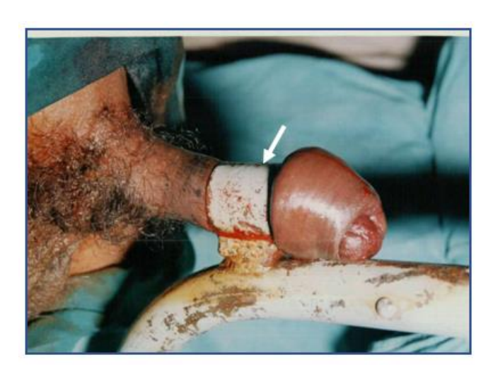
Fig. 4. Photograph showing after reduction of penile size