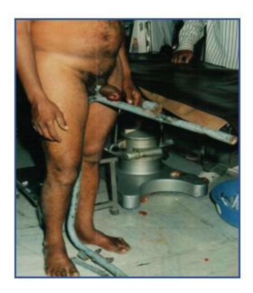
Fig. 1. Photograph showing Penile strangulation in the metal pipe

At the 4-week follow-up, the wound had healed symptoms, erectile dysfunction, or priapism well, and the patient reported no urinary (Figs 1-6).