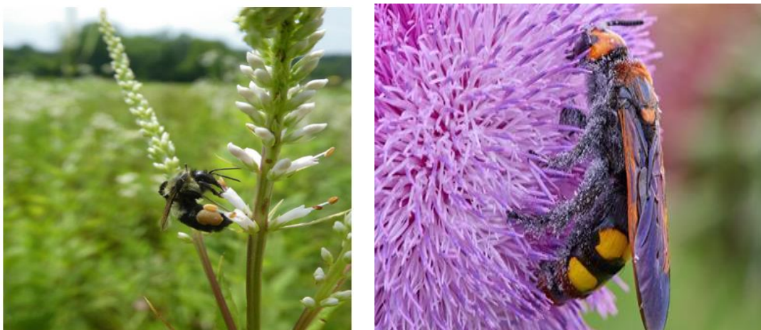
Fig. 2. Pollination

It should come as no surprise that the presence of efficient pollinators within plant communities is a necessary condition for the successful generation of seeds in the majority of plant species. It is possible for plants to fail to produce fruits or seeds if they are selectively excluded from a certain group of pollinators that are successful. After conducting a worldwide meta-analysis, researchers found that excluding vertebrate pollinators from blooming plants that they visited resulted in a loss of fruit or seed production that was, on average, 63% lower [73].