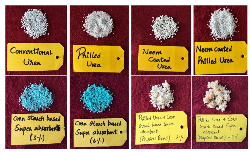
Fig. 2. Different types of urea fertilizers