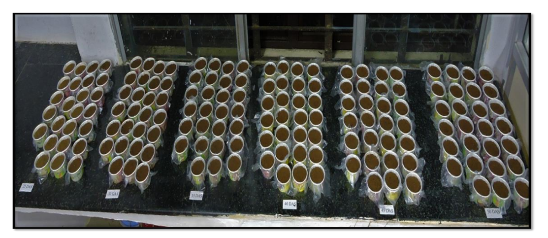
Fig. 1. Mineralization of different types of urea fertilizer kept at different intervals

To determine NH4+-N and NO3- -N, 50 mL of filtrate was transferred to a distillation tube added with 0.5 g of MgO followed by digestion and distillation done to trap NH4+ in a receiving flask containing 4 percent boric acid with mixed indicators. Further, the receiver flask was titrated against 0.1N HCl and expressed as NH4+-N. However, to determine the NO3- -N, 0.50 g of Devarda's alloy was added to the same digested sample further, repeated the above procedure then expressed as NO3- -N [7].