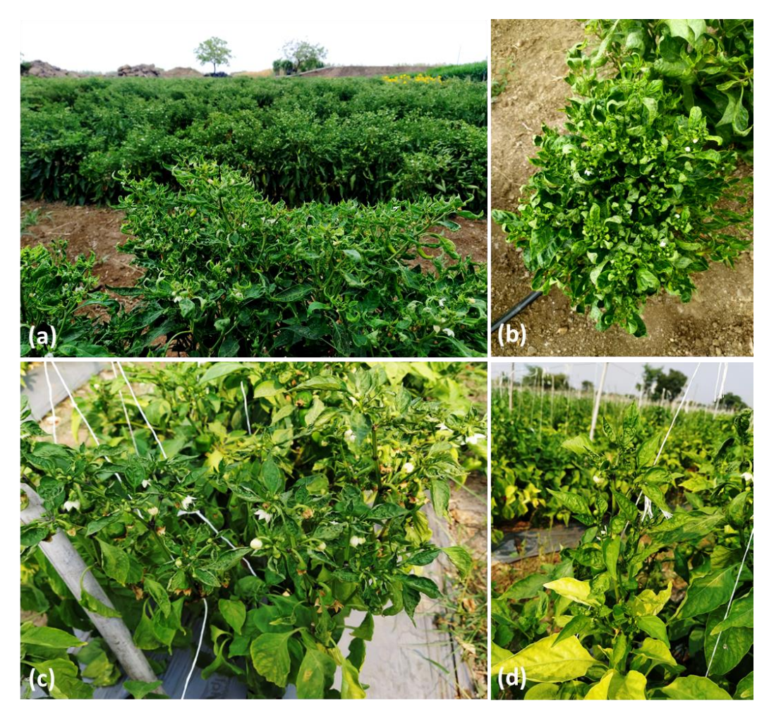
Fig. 2. Chilli plants showing ChiLCD symptoms at Kemwadi village in Osmanabad district (a & b) and Ranmasle village in Solapur district (c & d)