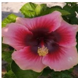
Origin: USA California