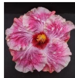
Origin: French Polynesia