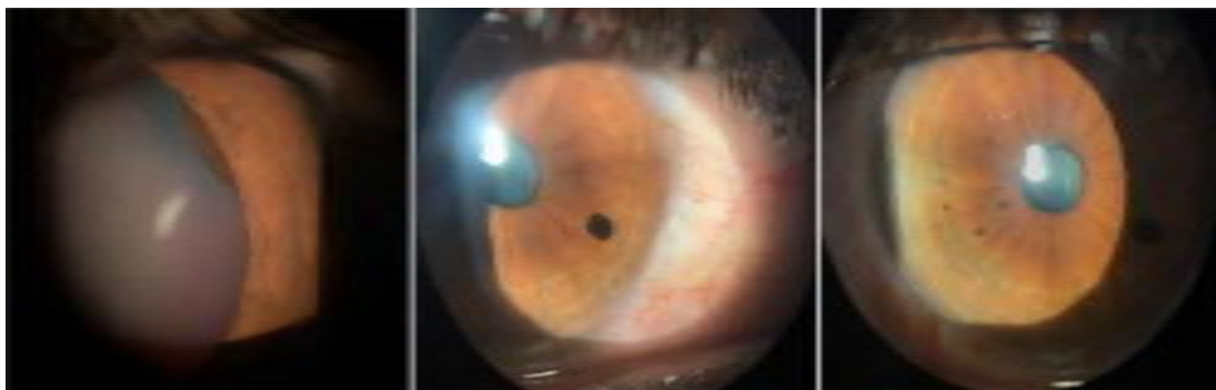
Fig. 1. Bio-microscopic examination of the right eye: Brown pigmented iris, with 1nevus on the middle part of the iris of 1.5 mm on the 4-hour time zone, and several small nævi of <1mm between 8 am and 10am

After dilation, the OD examination was strictly normal. At the level of the OG, the mass was visible around the pupil, far from the visual axis, pigmented and well limited, with a phacosclerosis of the lens segment facing it. The examination of the fundus found a healthy papilla with a C/D of 3/10, symmetrical to that of the contralateral eye and a foveolar region with a good macular reflection. A UBM ultrasound was requested, which showed at the level of the left eye a very limited tissue formation of hyperechoic lobed contours measuring 5x5.2 mm without hyper signal Doppler straddling the ciliary body and iris suggestive of melanoma or another epithelial tumor, which on the orbital MRI corresponded to an anomaly in the signal of the left ciliary body that was hypointense on T2 isointense in T1 compared to the vitreous measuring 4x2.5mm and not enhanced by contrast. Diagnosis of ciliary body melanoma was made on both radiological and ophthalmoscopic data.