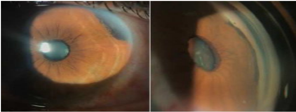
Fig. 2. Bio-microscopic examination of the left eye: Hyperpigmentation of the periphery iris is pushed forward against the ciliary band from 12:00 to 2:00, the iris is pushed forward against the ciliary band from 12:00 to 2:00, the iris is pushed forward against the ciliary band. At V3M, the mass is visible against the Irian pigmentary epithelium corresponding to the portion being conveyed. This mass appears well rounded, pigmented and covered a whitish membrane