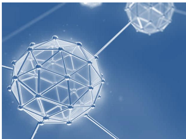
Image 1. Convergence of IoT and AI for enhanced nano materials processing

Nanomaterials processing is evolving rapidly due to nanoscience and nanotechnology. IoT and AI can revolutionise nanomaterial processing by enabling real-time monitoring, data-driven optimisation, and advanced production [58-62]. As demonstrated in Image 1, unlocking the full advantages of nano materials and driving technical improvements across sectors requires addressing the constraints and exploring the possibilities of IoT-AI integration in nano materials production.