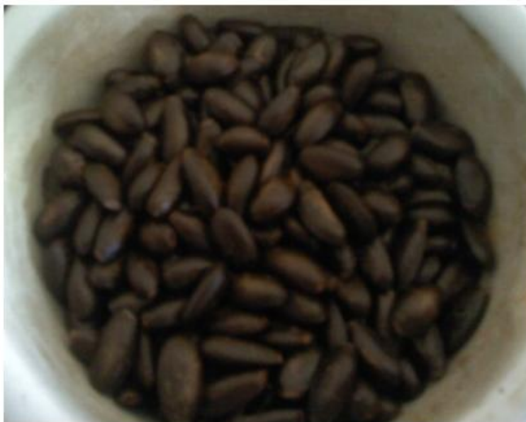
Fig. 1. Shade dried Annona reticulata seeds

Annona reticulata seeds were collected by completely removing the above fruit flesh (Fig. 1). Fresh seeds were washed with distilled water thoroughly to remove traces of contaminants. These processed seeds were then shade dried for one month (Fig. 2). After complete drying the seed coat was broken and powdered mechanically and was subjected to cold extraction using chloroform as the solvent system for about 96 h. After every 24 h fresh chloroform was added and chloroform containing the crude extract was separated, followed by ethanol extraction sequentially in the similar fashion. Both extracts were filtered and concentrated in vacuo under reduced pressure and allowed for complete evaporation of the solvent on water bath and finally vacuum dried. The yield of crude ethanol and chloroform extract for 1 kg of powdered seed material were 46 g and 53 g respectively.