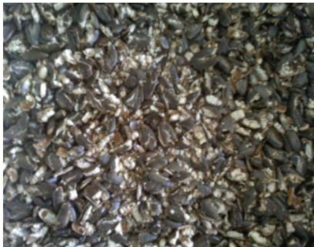
Fig. 2. Powdered Annona reticulata seeds